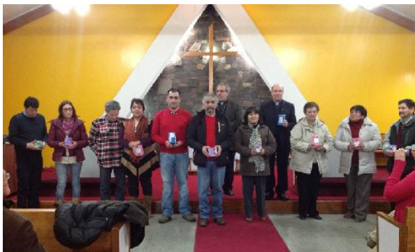
Church members with collecting boxes at a service of dedication for the mission to Tierra del Fuego

The return fare by boat to Porvenir is £16.25 per person, and to rent a house for worship would cost £325 a month, so money is needed for this work to continue. Members of the two Methodist Churches on the mainland have been given collecting tins, and several friends and acquaintances have become “Friends of Porvenir Mission”, promising monthly contributions which currently total £108 a month.