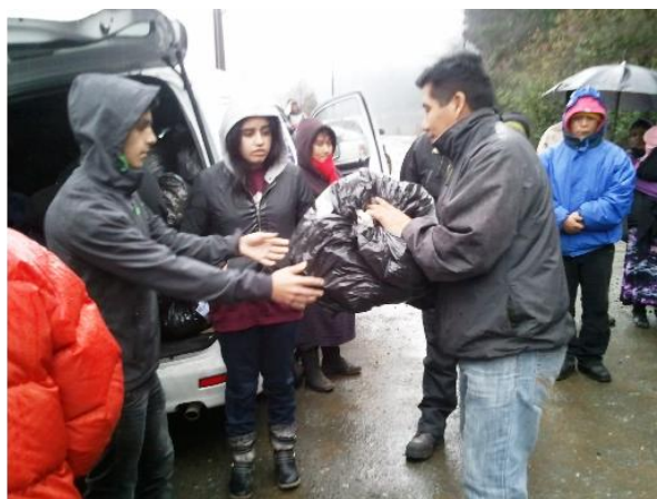
Handing over the first parcel on July 12th, 2014

July brings deep snow, freezing winds and little to eat for the Pehuenche communities living high in the Andes Mountains. This year the Trust contributed £170 to buy 10 food parcels for delivery by members of the Chilean Anglican Church.