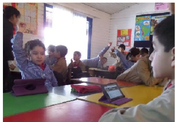
Enthusiastic children try out the Android computers donated to the Puelmapu School in Santiago on a visit organized by Chile for Christ.