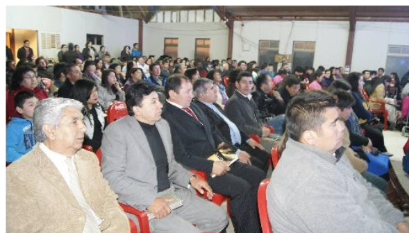
Standing room only in the still unfinished main hall on October 12 th .