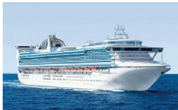
The Princess Line's cruise ship "Golden Princess"