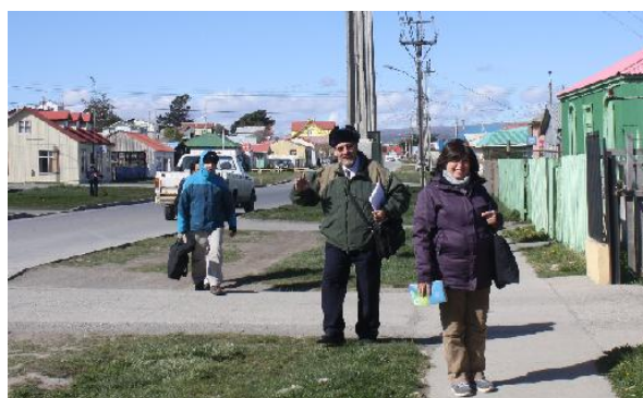
House to house visiting in Porvenir